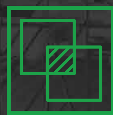
Image Fusion (day and thermal)

Temperature measurements capabilities and color pallets for better versatility.