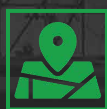
Image fusion (day and thermal) for improved orientation and gas detection.